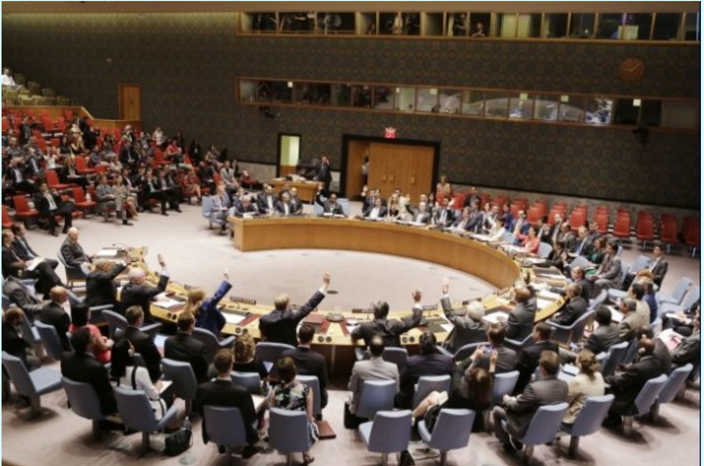
The Security Council

UNITED NATIONS (IPS) - When all 15 members of the Security Council raised their collective hands to unanimously vote in favour of the nuclear agreement with Iran, they were also defying a cabal of right-wing conservative U.S. politicians who wanted the United Nations to defer its vote until the U.S. Congress makes its own decision on the pact.