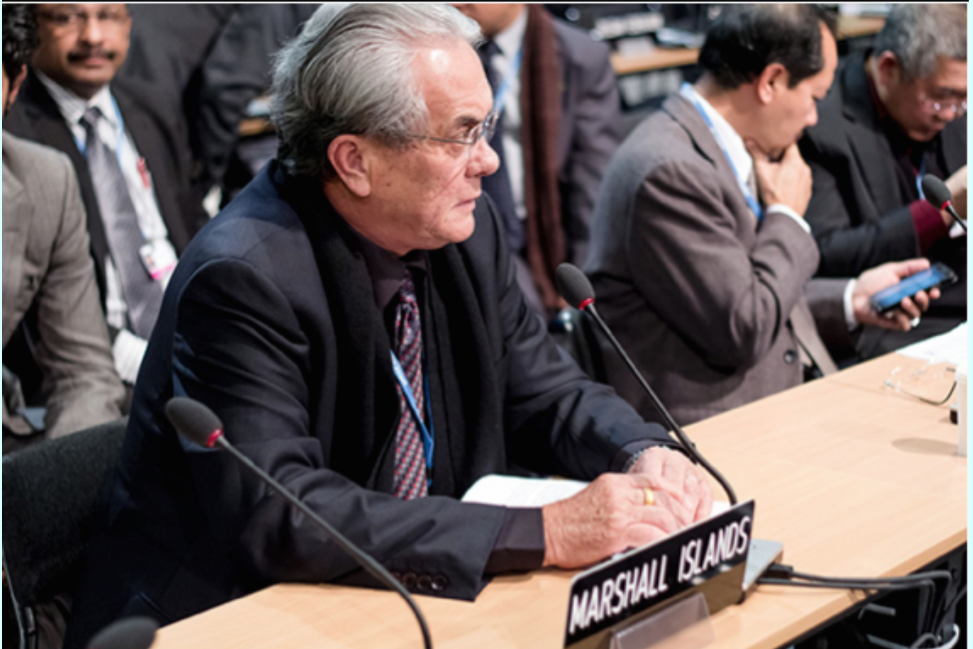
Marshall Islands' Minister for Foreign Affairs, Tony de Brum at the UN Climate Talks in 2013

SYDNEY (IDN) - As political conflicts magnify in the Middle East and North Africa with the spectre of brutal violence from terrorist organisations like ISIS, and the Ukraine crisis reignites the Cold War between the United States, its NATO [North Atlantic Treaty Organisation] allies and Russia; it is imperative that nuclear-armed and non-nuclear states together work for total elimination of nuclear weapons. The risk of use of nuclear weapons, by deliberation or accident, leading to total annihilation looms large more than ever before.