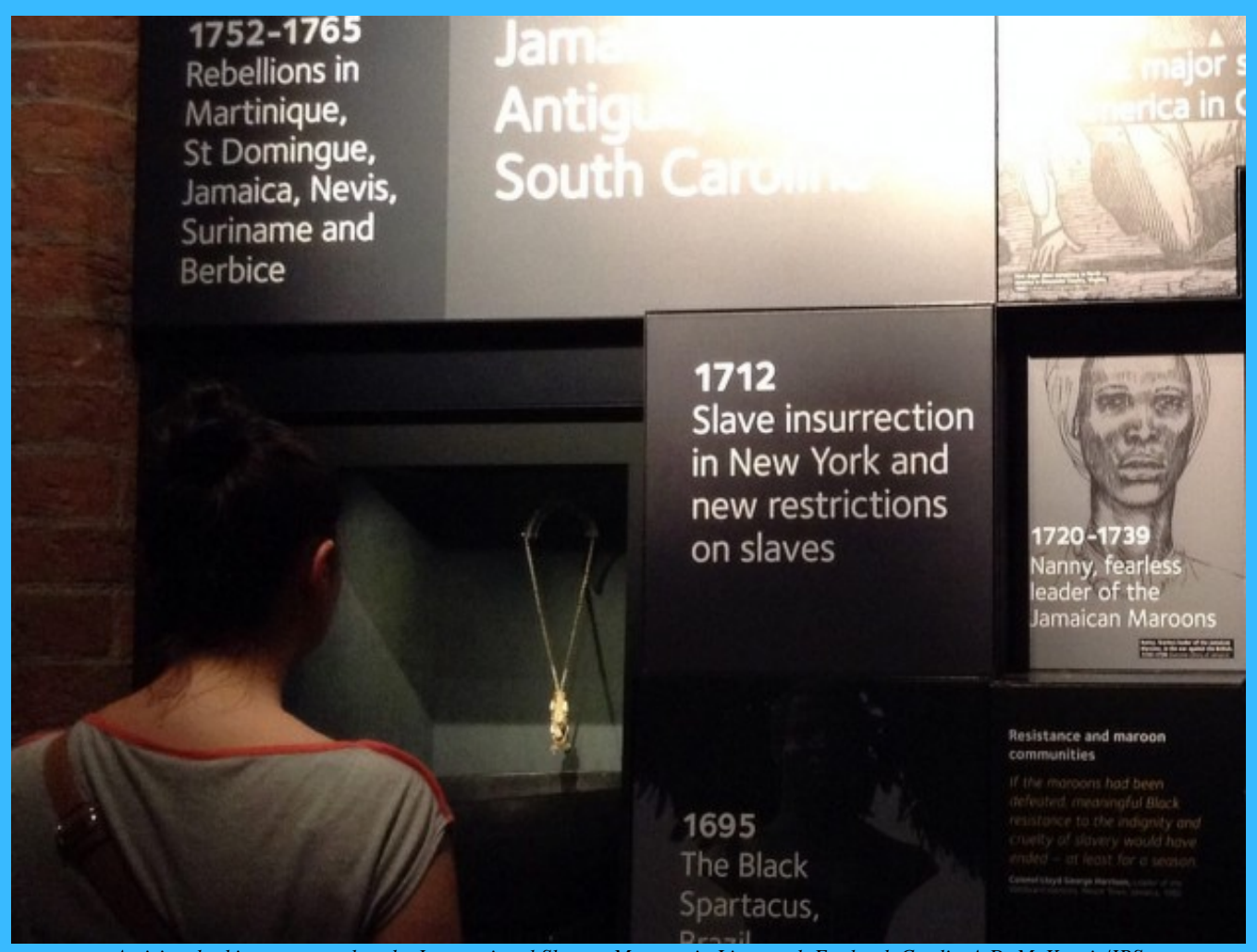
A visitor looking at a panel at the International Slavery Museum in Liverpool, England.

LIVERPOOL, England (IPS) - An exhibition on modern-day slavery at the International Slavery Museum in this northern English town is just one example of a museum choosing to focus on human rights, and being "upfront" about it.