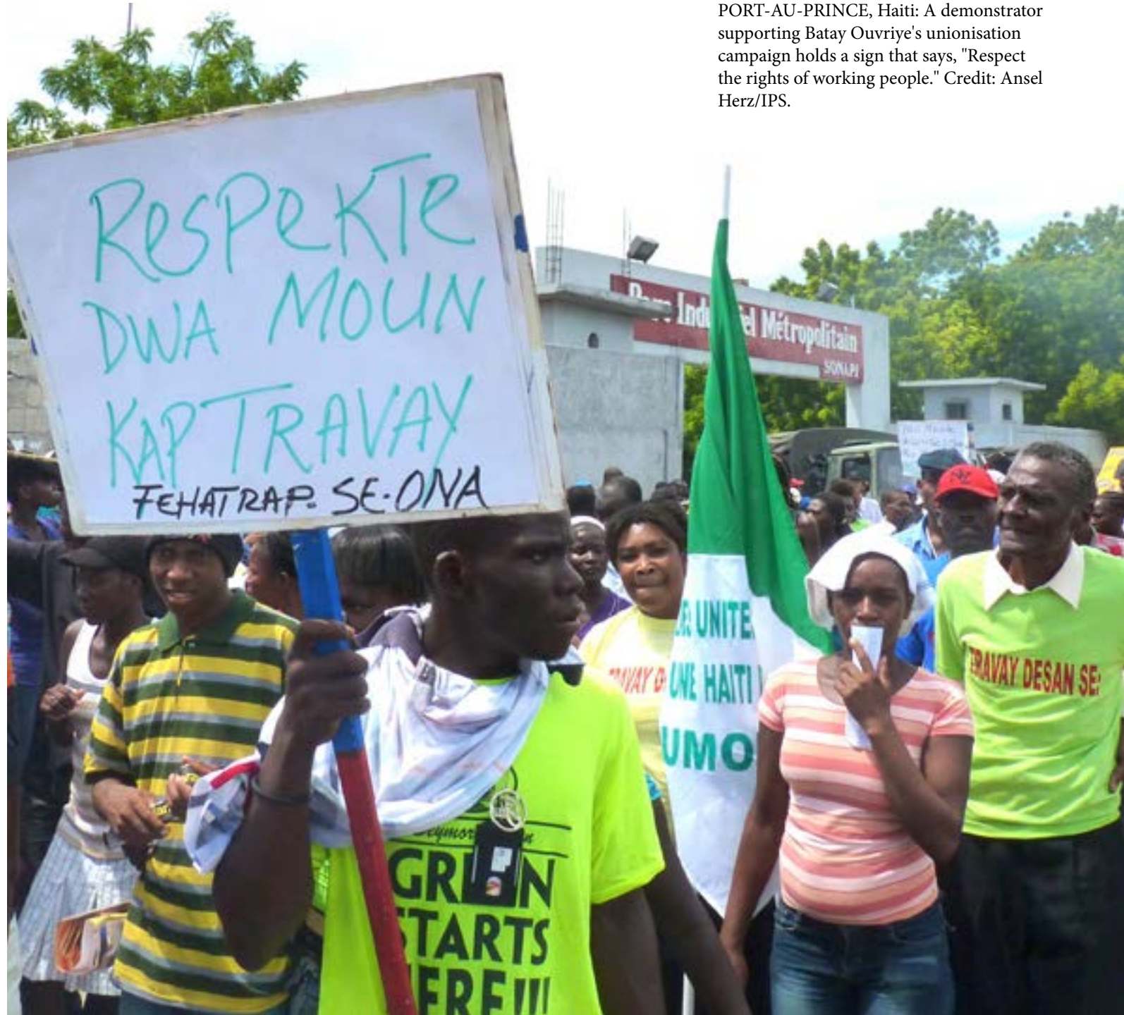
PORT-AU-PRINCE, Haiti: A demonstrator supporting Batay Ouvriye’s unionisation campaign holds a sign that says, “Respect the rights of working people.”