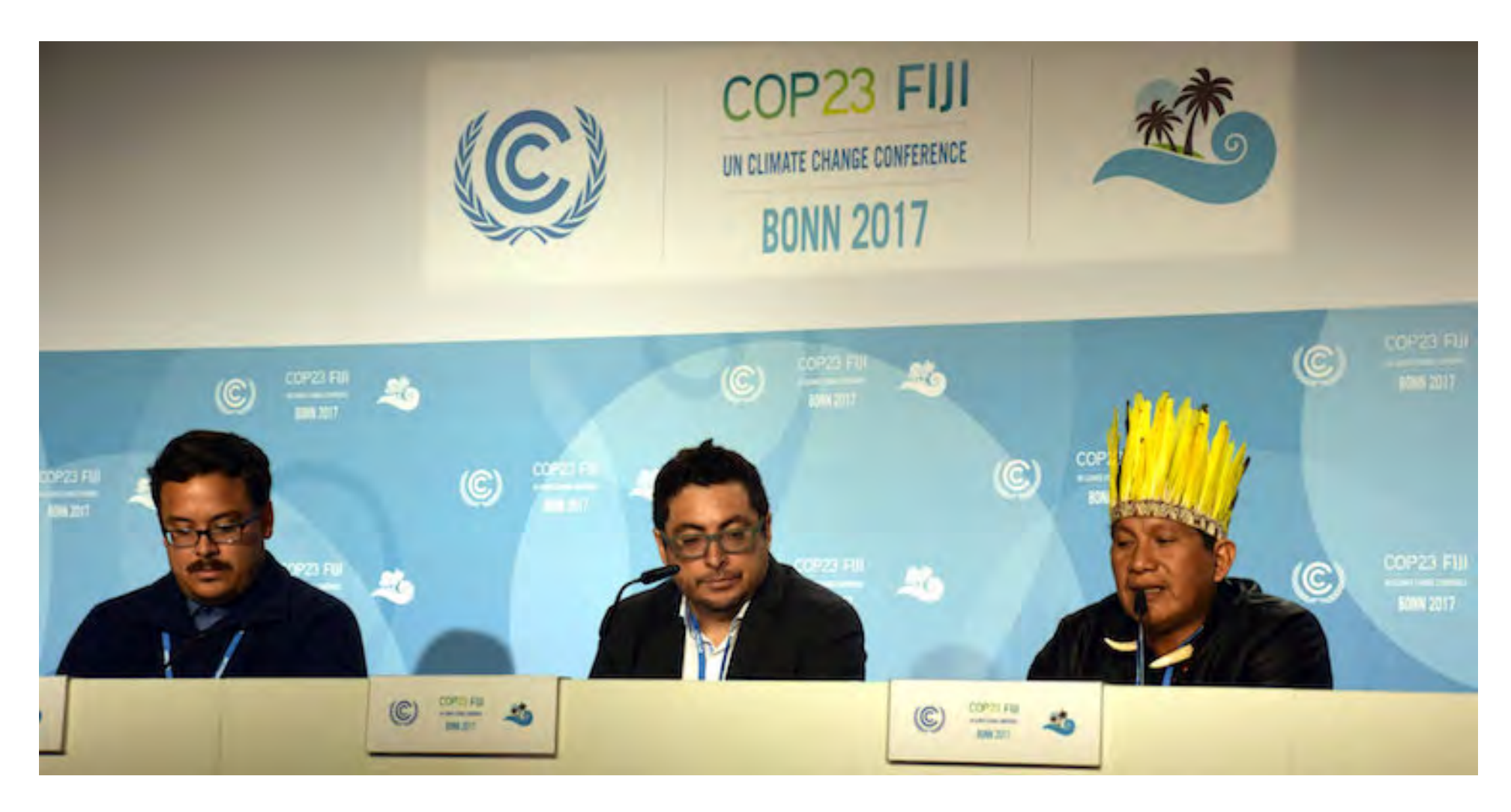
Image: Leaders from Indigenous communities speak at a press conference in COP 23