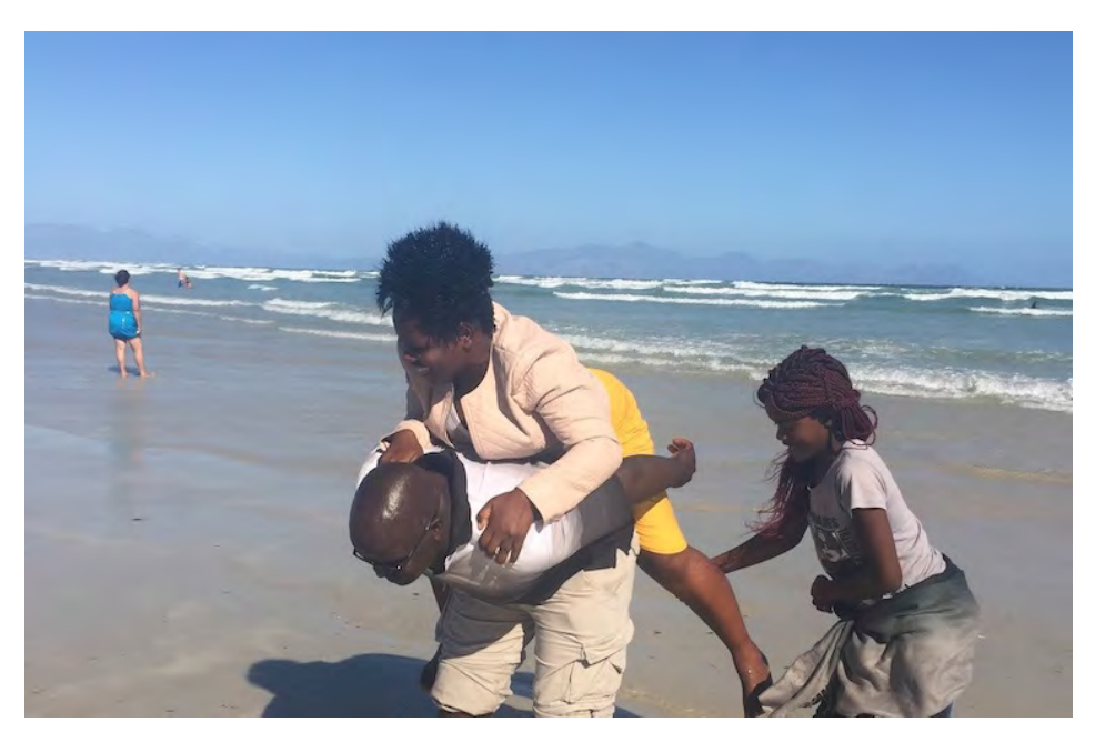
[IDN-InDepthNews – 5 June 2017]

Meanwhile, for Zimbabweans like Dube, giving a thought to ocean life may remain secondary. "Shall I breed diseases with garbage lying in my backyard because I have to protect some ocean life which I don't see near me?" she asked.