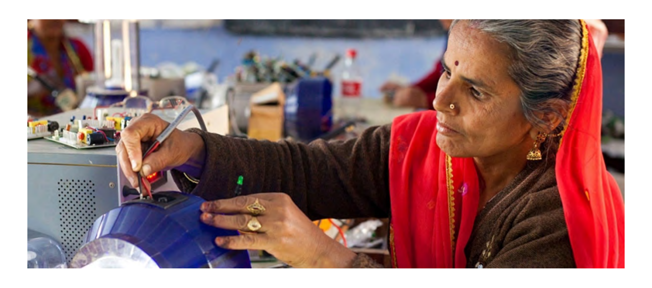
Image: Solar engineering trainer, Barefoot College, India