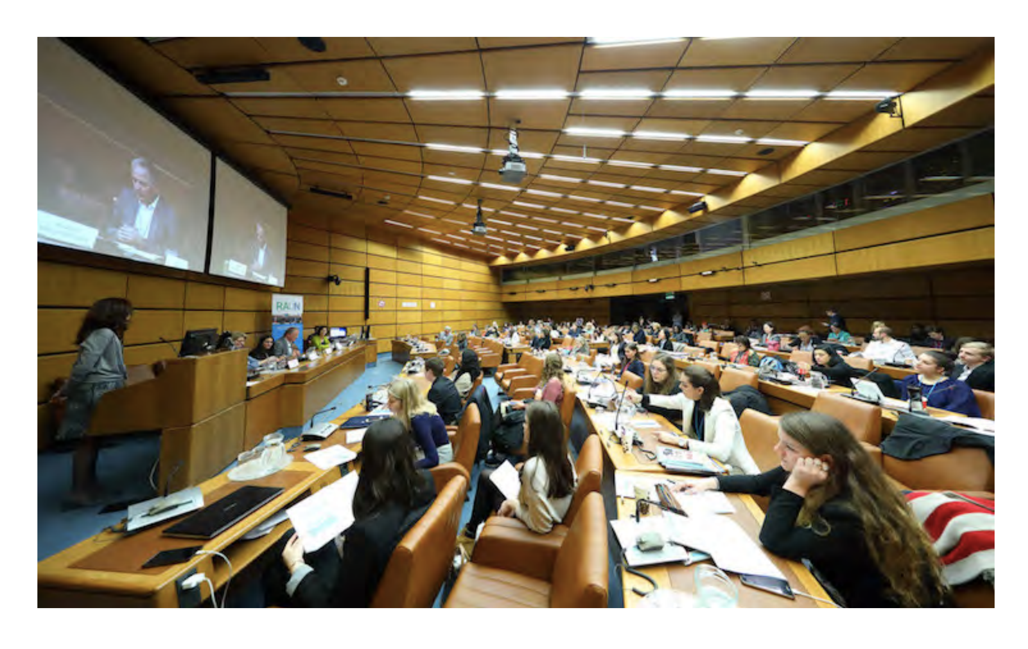
Image: A general view of the Vienna UN Conference