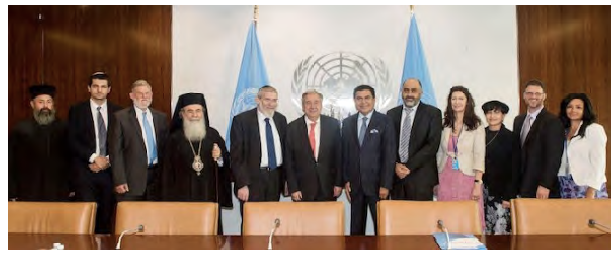
2018 REPORT OF THE JOINT MEDIA PROJECT - 91

"As I have continuously stressed, the two-state solution is the only path to ensure that Palestinians and Israelis realize their national and historic aspirations and live in peace, security and dignity. The expansion of illegal settlements, or the violence or the incitement undermine this prospect," said