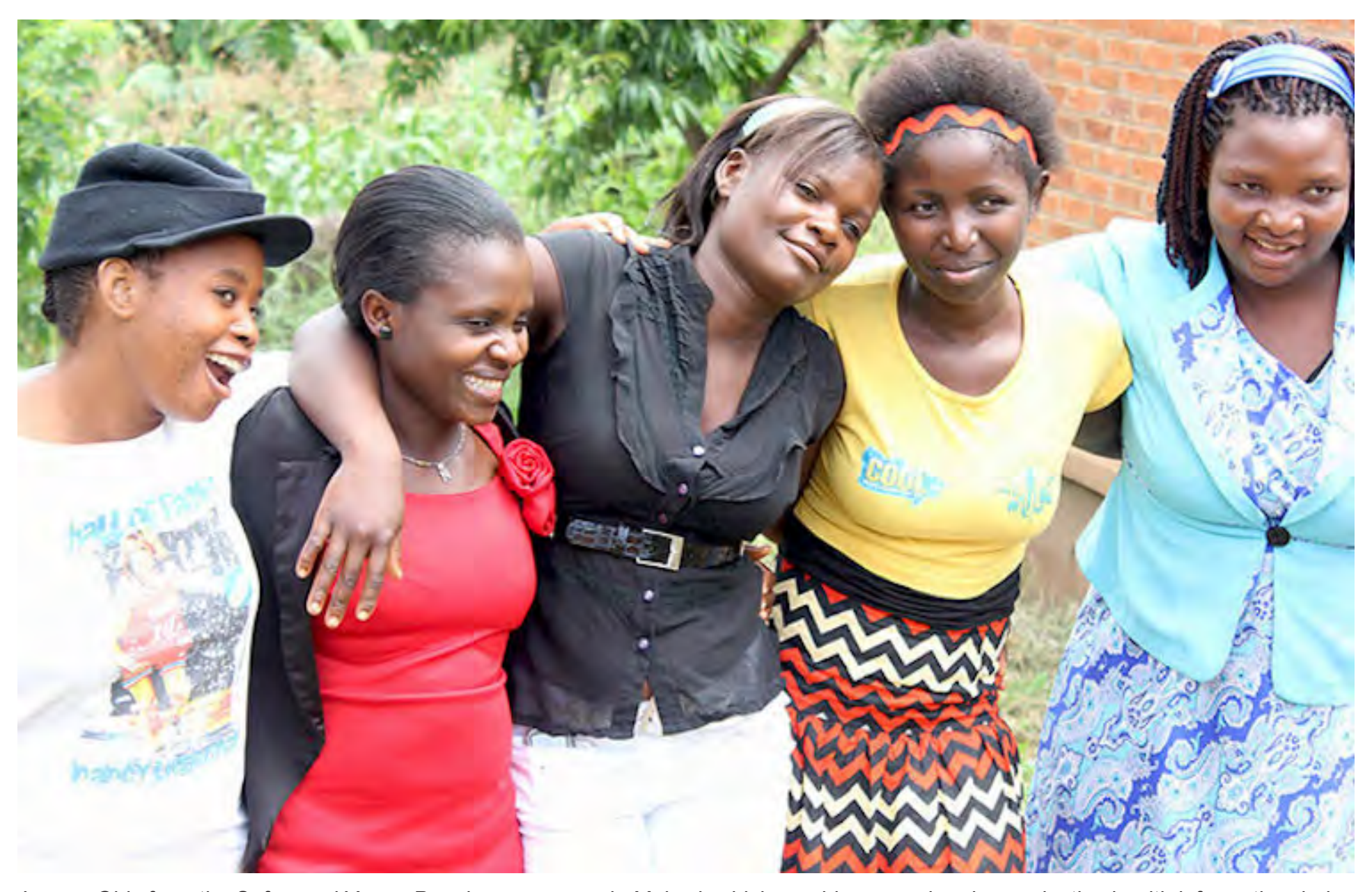
Image: Girls from the Safeguard Young People programme in Malawi, which provides sexual and reproductive health information, helps young people access health services, and offers leadership training