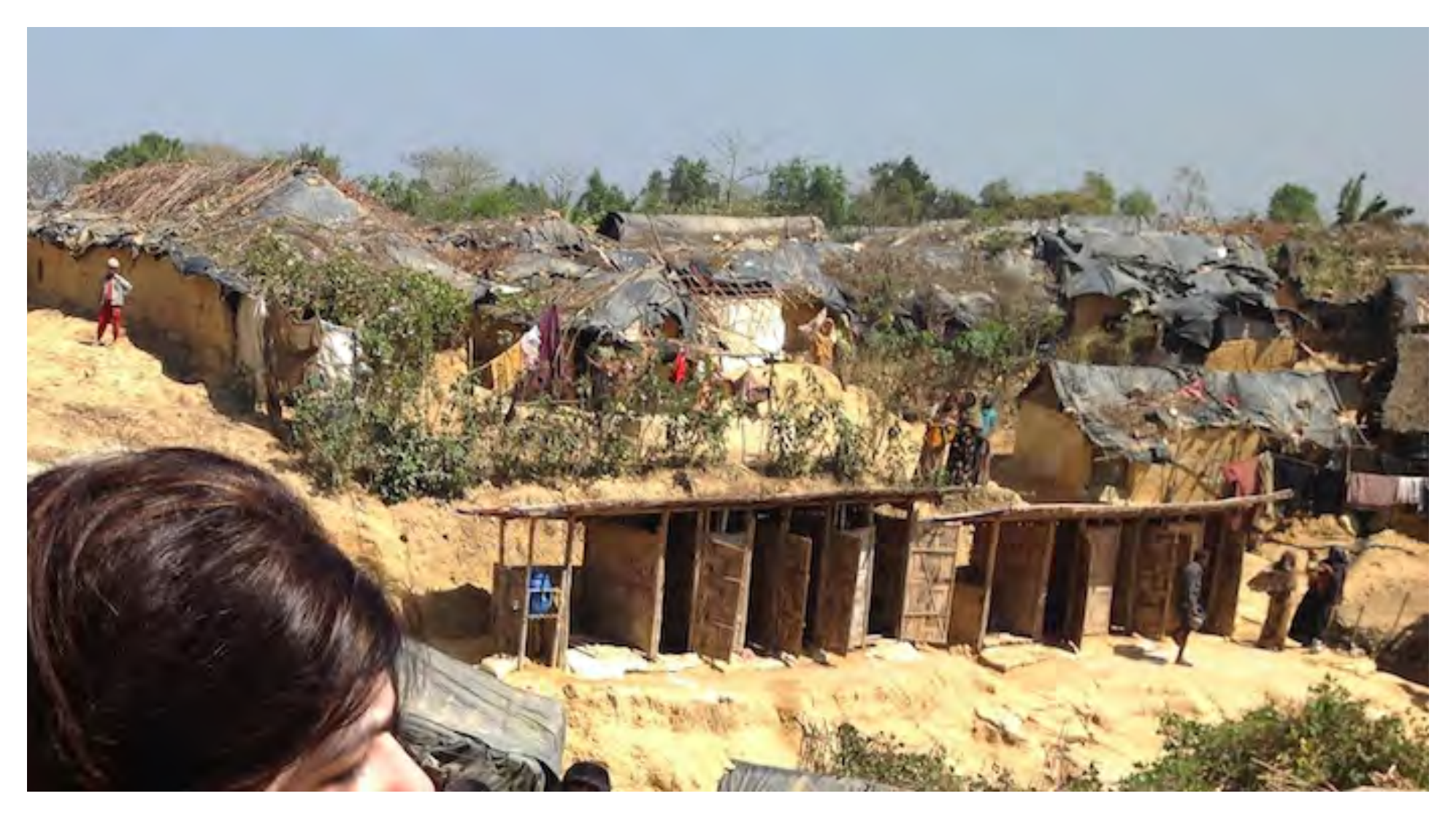
Image: Kutupalong Refugee Camp in Cox's Bazar, Bangladesh. The camp is one of three, which house up to 300,000 Rohingya people fleeing inter-communal violence in Burma