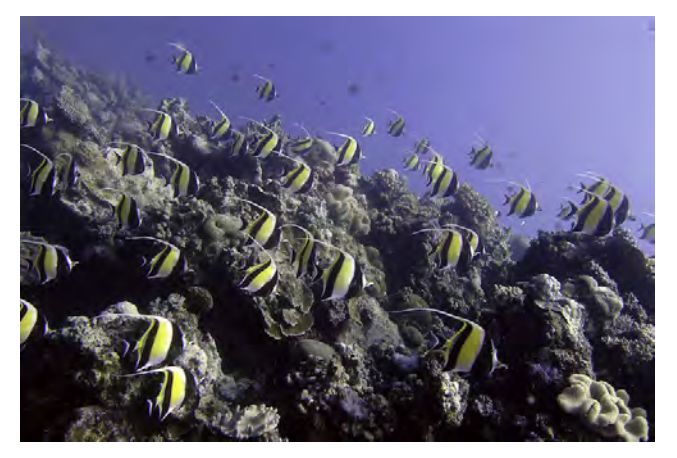
Image: A school of Moorish Idols cruise over the coral reef, Ha'apai, Tonga

"We cannot manage what we cannot measure, and no single country is able to measure the myriad changes taking place in the ocean. From Fiji to Sweden, from Namibia to the Arctic, all Governments and partners must share knowledge to craft common science-based policies," Bokova added. [IDN-InDepthNews – 12 June 2017]