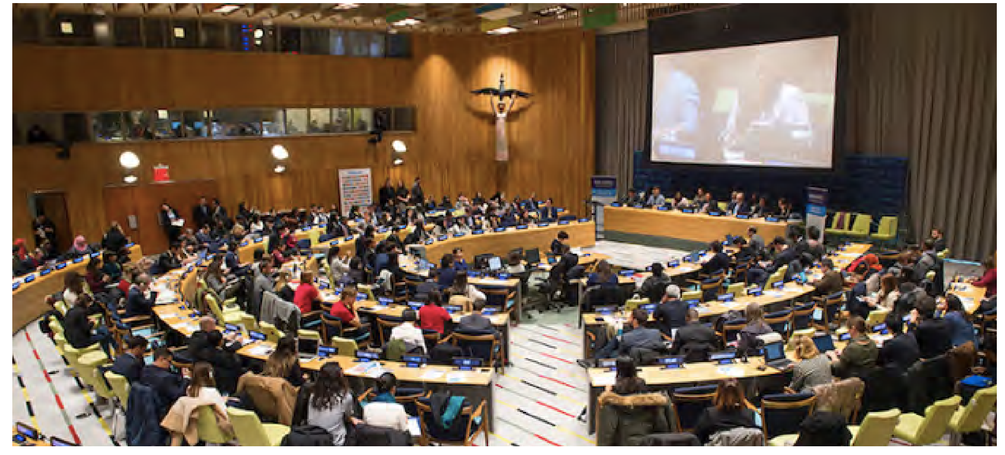
2018 REPORT OF THE JOINT MEDIA PROJECT - 108

Meanwhile, the report of the Task Force said the progress identified in all seven action areas of the Addis Agenda, included financing flows, namely domestic public resources, domestic and international private business and finance; and international development cooperation; trade, debt, systemic issue, and science, technology,