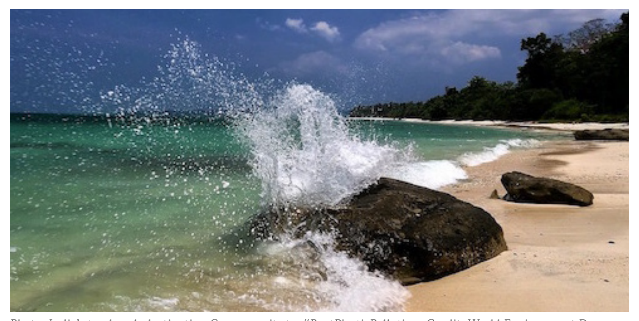
Photo: India's top beach destination Goa commits to #BeatPlasticPollution.

BANGALORE (IDN) – A 32-year-old Rajeswari Singh launched on a six-week marathon mission on World Earth Day setting out to walk some 1,100 kilometres from Vadodara in western India to reach New Delhi on World Environment Day on June 5, spreading a simple message 'Stop using plastic', and accentuating it by forgoing all the way any kind of plastic packaged drinks or food.