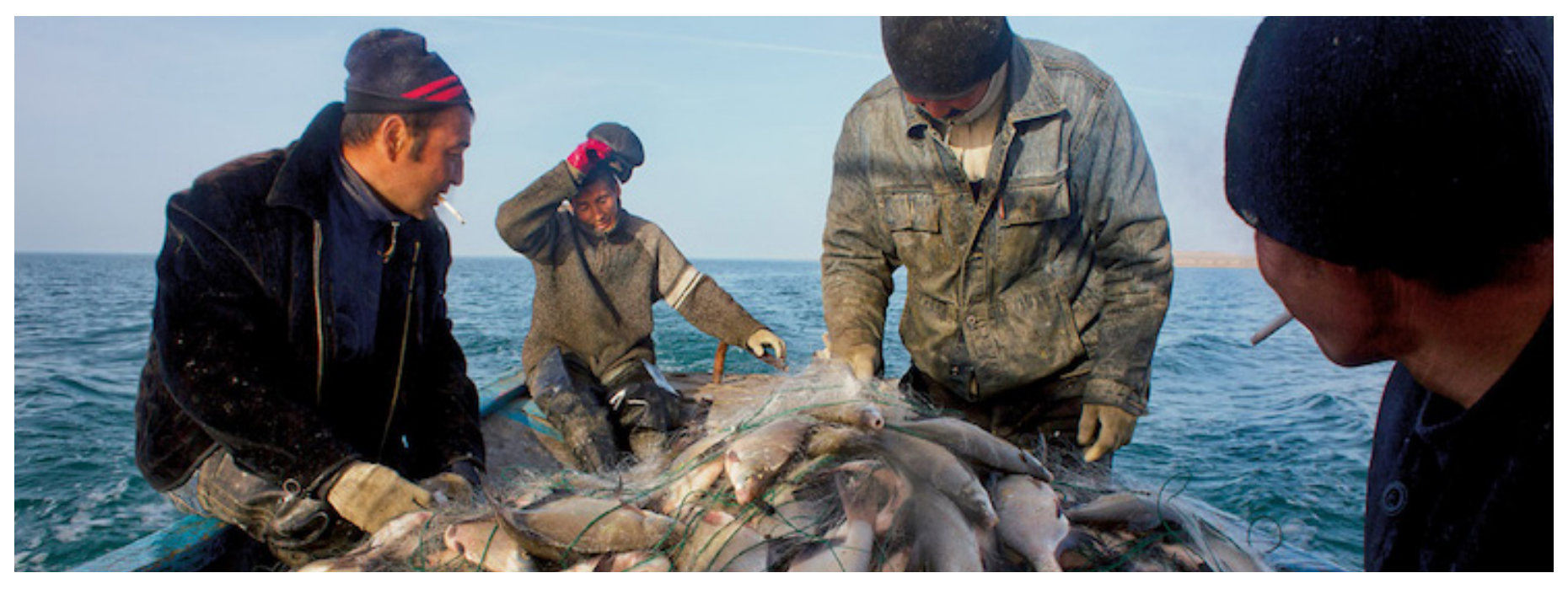
Photo: Working from dusk until dawn, fishermen from around the town of Aral in Kazakhstan haul in a catch from the North Aral Sea, where the water level has risen and salinity has decreased – in stark contrast to the larger South Aral Sea, which has gone nearly dry.

NEW YORK (IDN) - The zone of destruction created as a consequence of what has been called "one of the planet's worst environmental disasters" has long crossed the frontiers of Central Asia, demanding urgent measures from the international community.