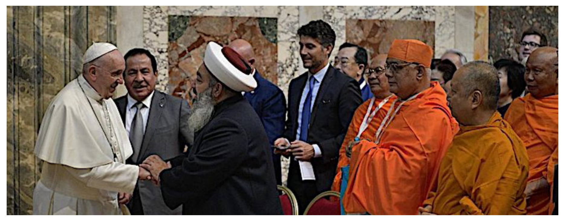
Photo: Pope Francis addresses participants of an international conference entitled, 'Religions and the Sustainable Development Goals'.

BERLIN | VATICAN CITY (IDN) – Much water has flown under the Tiber bridges since the Holy See declined an invitation in 1923 to join the League of Nations stating that its only competency was in matters of elucidation of questions of principle in morality and public international law.