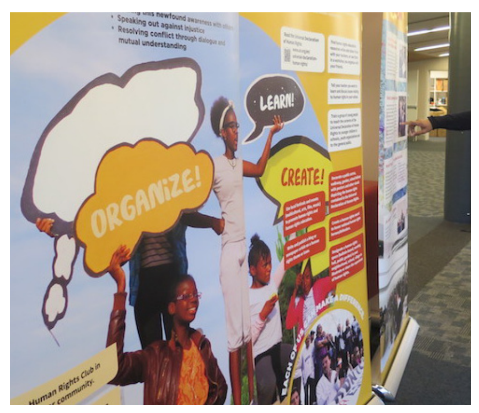
Photo: A glimpse of the exhibition on human rights education.

SYDNEY (IDN) – More investment is needed in human rights education and strengthening of civil society to address inequality and sustainability – the main objectives of the United Nations Sustainable Development Goals. This was the key message from the Ninth International Conference on Human Rights Education (ICHRE) held in Sydney, Australia.