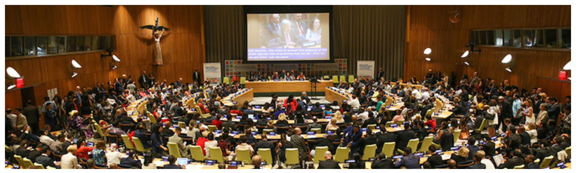
Photo: The 2018 High-Level Political Forum on Sustainable Development concluded on 16 July, following a full day of Voluntary National Reviews, and the continuation of the High-Level General Debate in the afternoon. A Ministerial Declaration was adopted during the closing session on the theme 'Transformation towards sustainable and resilient societies.'

UNITED NATIONS (IDN) – Three years since the 2030 Agenda and the Sustainable Development Goals (SDGs) were adopted by the UN, at first glimpse progress seems to have been made in "transforming our world" by implementing "a plan of action for people, planet and prosperity."