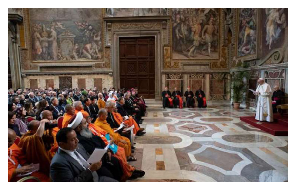
Photo: Pope Francis addresses participants in a conference on religions and the sustainable development goals, in the Vatican's Clementine Hall March 8, 2019.

VATICAN CITY (IDN) – Nearly six months before the heads of state and government convene to review the implementation of the 2030 Agenda for Sustainable Development at the UN General Assembly's 'SDG Summit' in September, the world religions have tasked themselves with elaborating "a road map or lines of action that can connect religious contributions to the implementation of the SDGs".