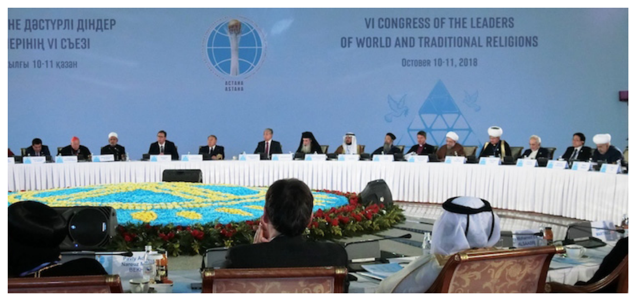
World Religious Leaders' Astana Congress Pledges 'Unity in Diversity'

ASTANA (IDN) - At a critical point in time when religious tolerance is being consigned to oblivion, an international conference has appealed "to all people of faith and goodwill" to unite, and called for "ensuring peace and harmony on our planet".